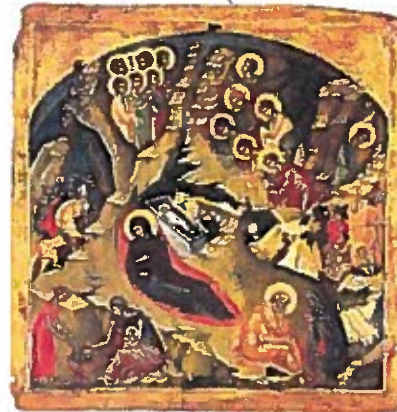
The Nativity of Our Lord Jesus Christ

This icon is more than just a beautiful Christmas piece. It conveys important theological truth as all icons do. Jesus is wrapped in swaddling cloths in such a way that he resembles one wrapped for burial. This indicates that He was born to die for us. The red heifer is present in the cave, which is symbolic of being offered as a sacrifice for the sins of the people. The ass which bore Mary and Him out of town for his birth is there foreshadowing the Triumphal Entry as He goes willingly to the Cross to reconcile us to Himself. The angel in the mountains is shown above the three shepherds. This tells the story of how the angel appeared to the shepherds singing and glorifying the birth of Christ, calling them to join in the praise. One of the shepherds is blowing the shofar, which signifies the coming of the year of jubilee or the year of the Lord's favor as in Isaiah 60 and 61. St. Joseph the Betrothed is shown in a struggle against his temptation. The old man talking to him represents his temptation, when he considered "putting Mary away quietly" not knowing whose child she was to bear. The three men on horseback are the Magi following the star that is being guided by God so they can worship the King, Jesus Christ.